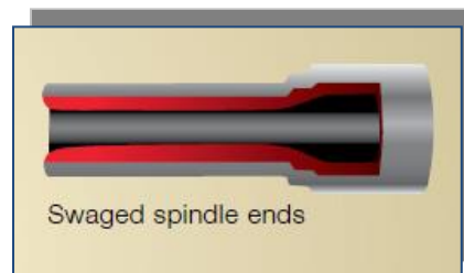
Swaged spindle ends

The K Hitch series of ONE-PIECE FORGED AXLES are available in a variety of configuration to suit most application.